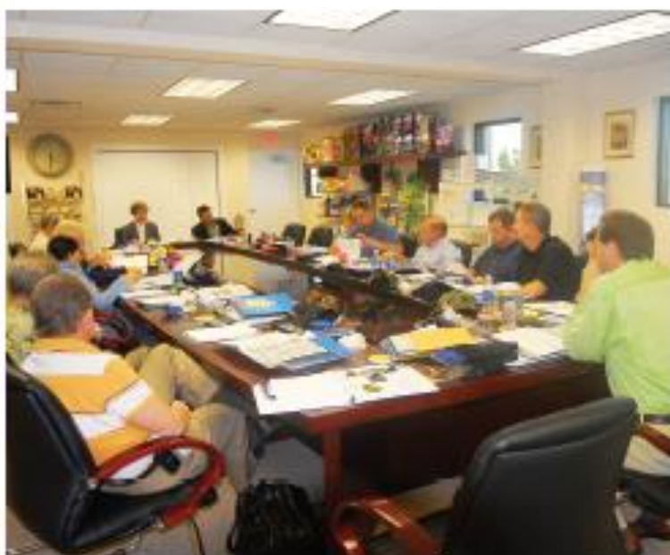
The I.I.D.A. Team in a client strategy and retail planning session at our Stuart, FL Headquarters

We cannot direct the wind, but we can adjust the sails.